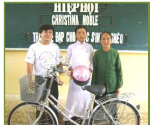
Presenting a bicycle and a helmet to a provincial student (22.10.2009)

Talk and guidance on how to wear their helmet, before the presentation of bicycles