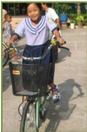
Happiness after receiving a bicycle