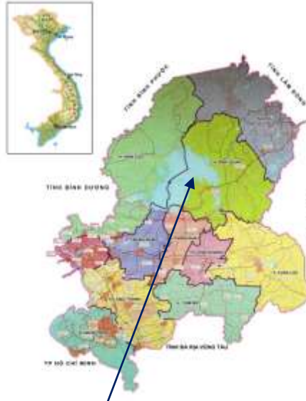
Long Thanh District, Dong Nai Province

CNCF and the Women's Union (WU) of Long Thanh established the revolving loan project in 1998 to meet the need of rural savings and credit of the poor women in many communes of Long Thanh District. The project was implemented by WU of Long Thanh District and its WU line system at commune level.