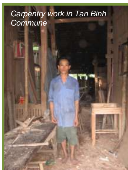
Carpentry work in Tan Binh Commune

To ensure that breeding animals are of quality, DOLISA made surveys of cow/ beef cattle supply and provided advice to the families. This is done in cooperation with SOLISA, FU and PRSC in Mo Cay Bac District and Tan Binh Commune. Experience is that poor villagers had little access to market and/ or supply information and required advice in many cases.