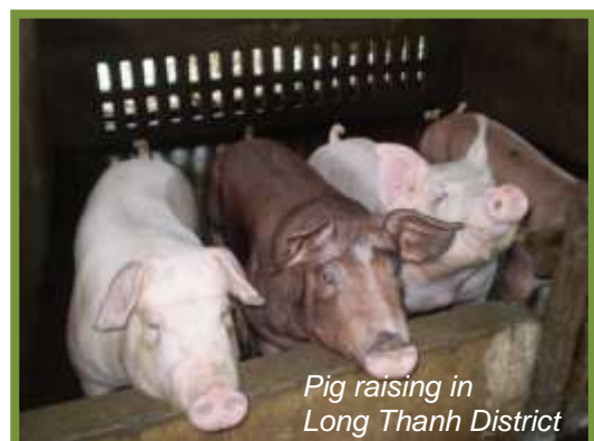
Pig raising in Long Thanh District

The fund has remained at VND200 million as of the 8 th loan cycle as WU of Long Thanh has successfully managed this fund since 1998. The interest rate is applicable at 0.5% per month and used to cover all management expenses and recovery of risks. The target groups were the women living in poverty in the communes, WU could easily combine their line system tasks with this loan project.