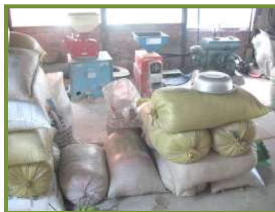
Rice husking service in Kien Giang Province

In general, the projects supported the selected families in poverty to start micro business to gain a sustainable livelihood. They also helped to create job opportunities for those who were at working age in the target communities, particularly creating opportunities for loan recipients to pay more attention to their children. And finally, the projects brought about social and economic benefits to the communities living in poverty. During the reporting period, 91 families in Ben Tre and Dong Nai Provinces were supported to start small business to gain sustainable livelihood. In the micro enterprise families, the economic activities helped to improve entrepreneurial capacity and create job opportunities for the local people. In the livestock families, the economic activities made the best use of leftover food, vegetable and grass available around or combined with other activities such as spinning coconut fibres, seedling nursing or micro enterprise.