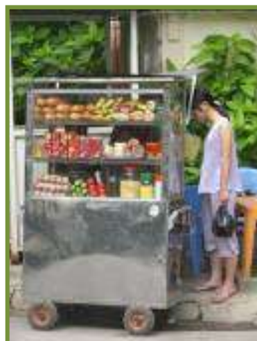
A family is supported capital for a small business of selling bread

"Every Child needs a foundation to grow and develop"