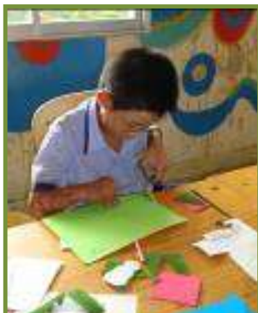
A child making a Christmas card