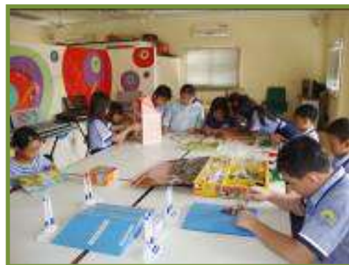
A library corner with lego and puzzles for kids at break