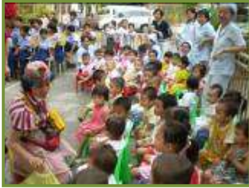
A performance by a clown from Holland