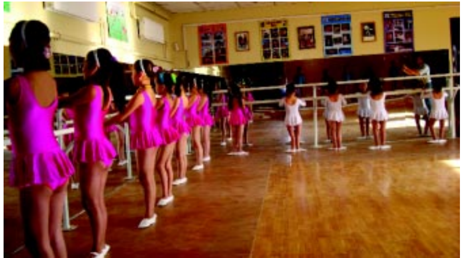
A Sunday dance class in the new Arts & Music building, Blue Skies Ger Village, Mongolia

The building has now been completed, and we hope that these photos demonstrate the kind of enjoyment such a program can bring. A party was recently held in the new building that houses the program, during which the children sang and put on a fashion show.