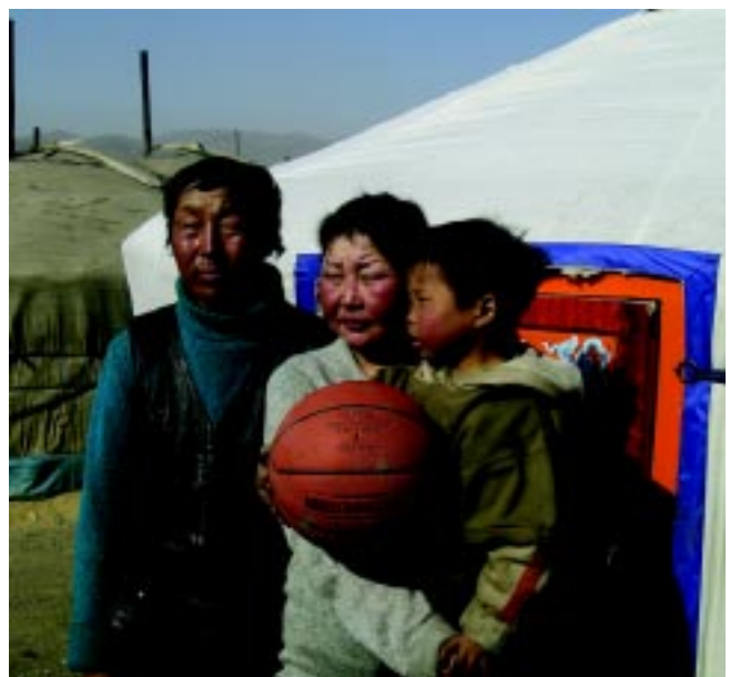
The family outside their new home

The Christina Noble Children's Foundation is dedicated to helping children in need with education, medical care, social opportunities and job placement. The Melbourne National Office manages the sponsorship of over 300 children in Vietnam and Mongolia, as well as volunteers who raise money via various community activities for projects in both Vietnam and Mongolia.