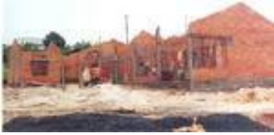
PHOTO: The Construction of Gung Re School