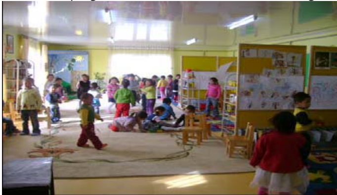
POTO: children playing in the newly renovated Ger village kindergarten.

The week has been set, 30 th June-3 rd July 2008 , for the UK fundraising week. We need all our UK supporters to take part in a week of events all set to raise much needed money for the Foundations education programs in both Vietnam and Mongolia.