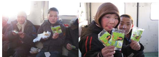
PHOTO: Young people receiving condoms from the night clinic.

Sexual health is a big concern for many of the older street children. With no national sexual health policy in Mongolia, free condoms are not readily available. These street children, with barely enough money to survive have no way of affording Condoms. In 2007 the night clinic served 4225 children and young people on its rounds. With girls making up 25% of this and boys 75%.