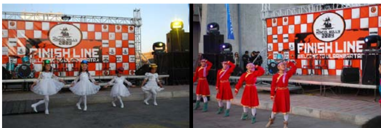
The Concert held in the main square: Ulaanbaatar.

The Adventurists, organisers of the Mongol Rally, put on a concert in the main square of Ulaanbaatar to celebrate the arrival of the teams. Children from the Blue Skies Ger Village and sponsorship programme were invited to take part and gave a spectacular show of dancing, singing and traditional music. The new addition to the Blue Skies Ger Village of a theatre and studio has enabled the children's talents to flourish.