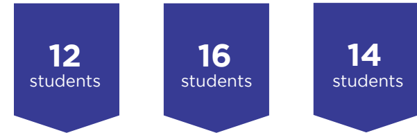
SSMC Aerobic Dance