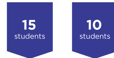
Girls' Home Art