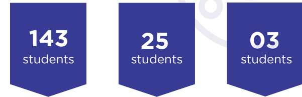
General Art & Music Class