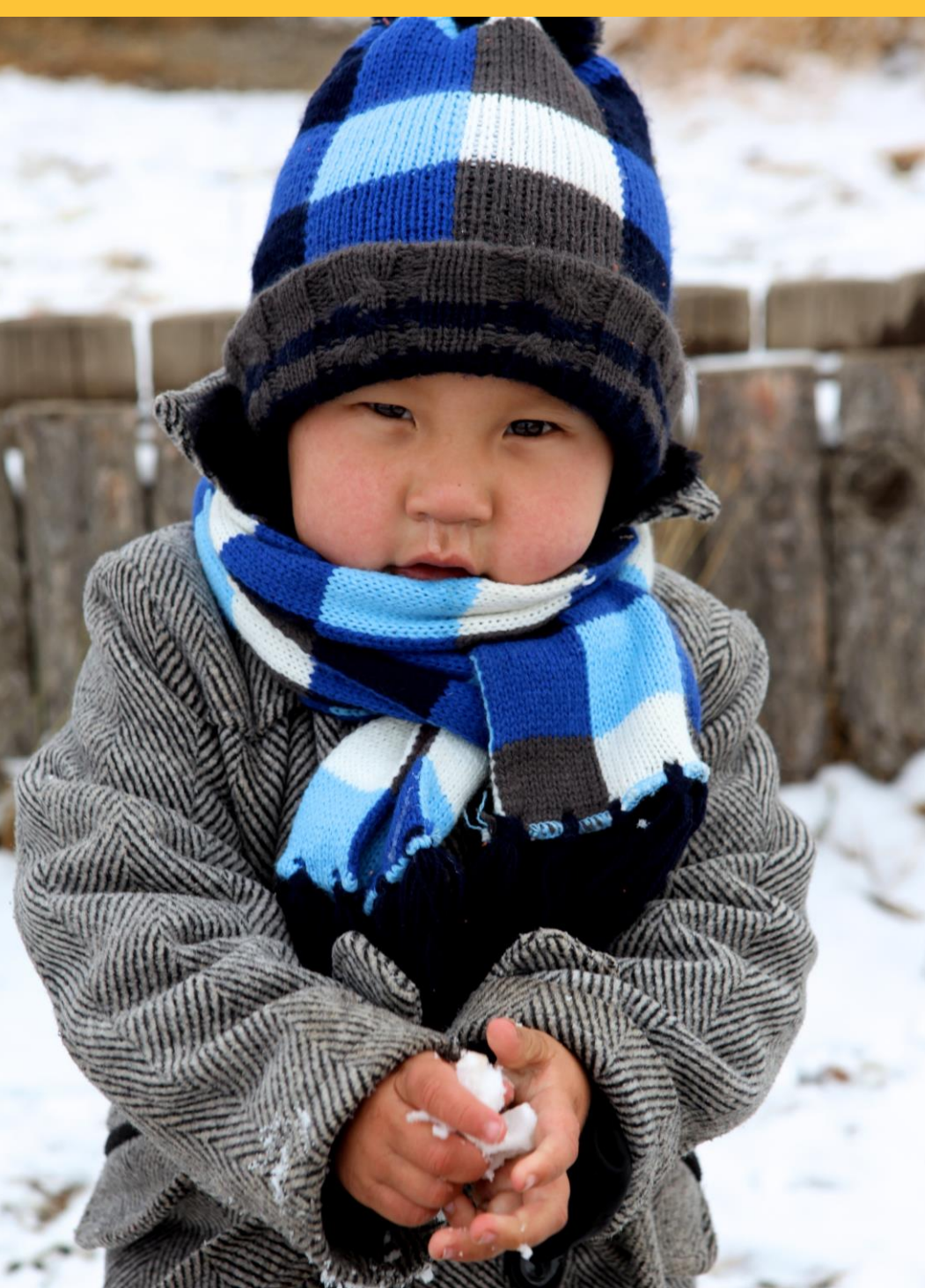
One of our little ones during a snowball fight!