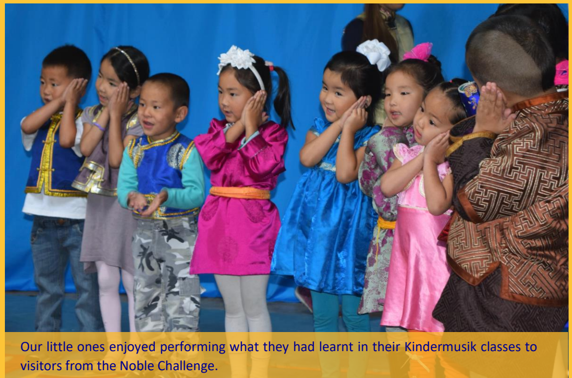
Our little ones enjoyed performing what they had learnt in their Kindermusik classes to visitors from the Noble Challenge.