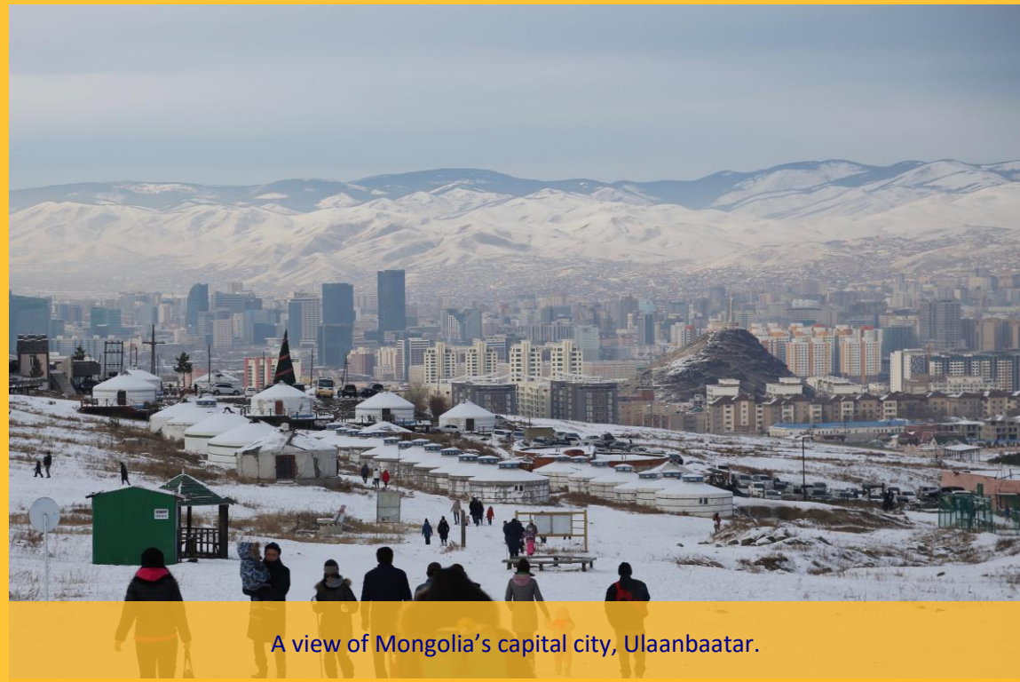
A view of Mongolia’s capital city, Ulaanbaatar.