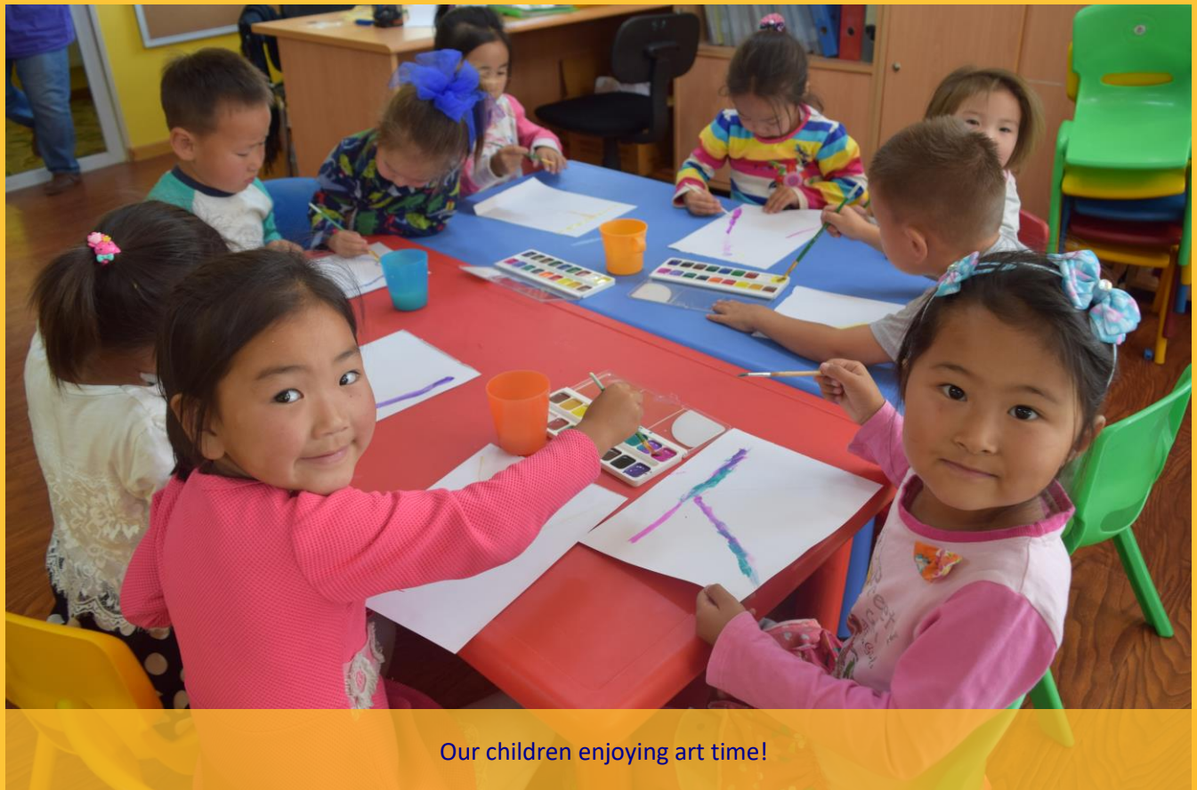
Our children enjoying art time!