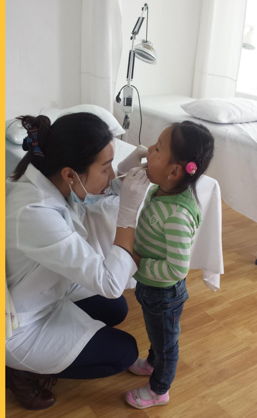
All of the children received dental examinations and follow-up treatments where necessary.

Through teaching our children these basic skills they have learnt how to prevent against many common ger district illnesses, and have developed an understanding of the importance of good personal hygiene and self-respect.