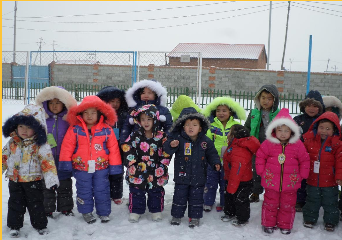
Our little ones wrapped up warm in their new winter clothes.