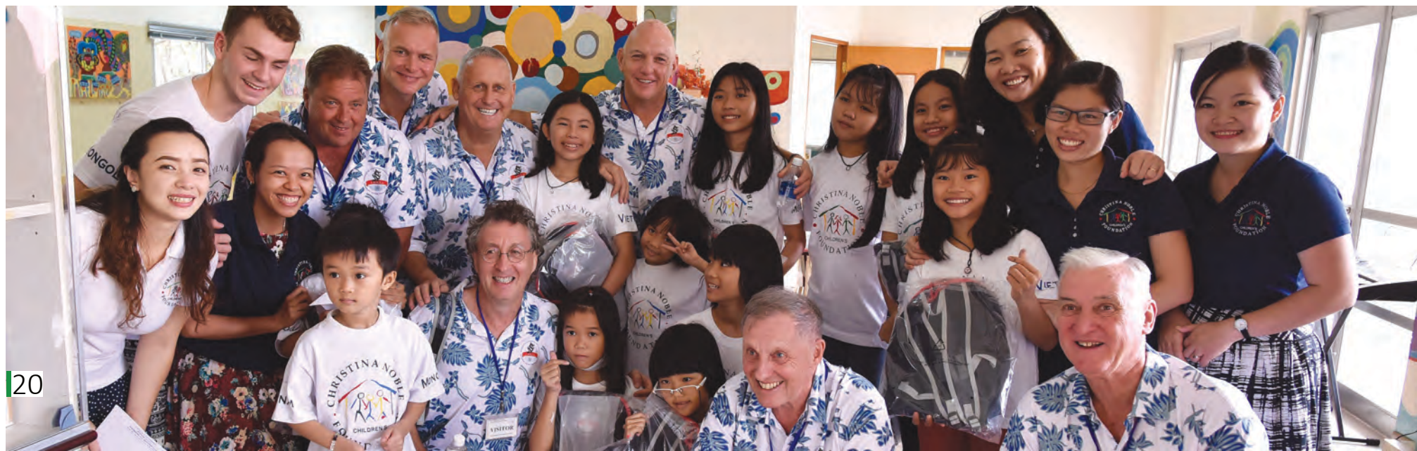
Photo: Our 2017 Donors the Wednesday Afternoon Golf Society Hong Kong