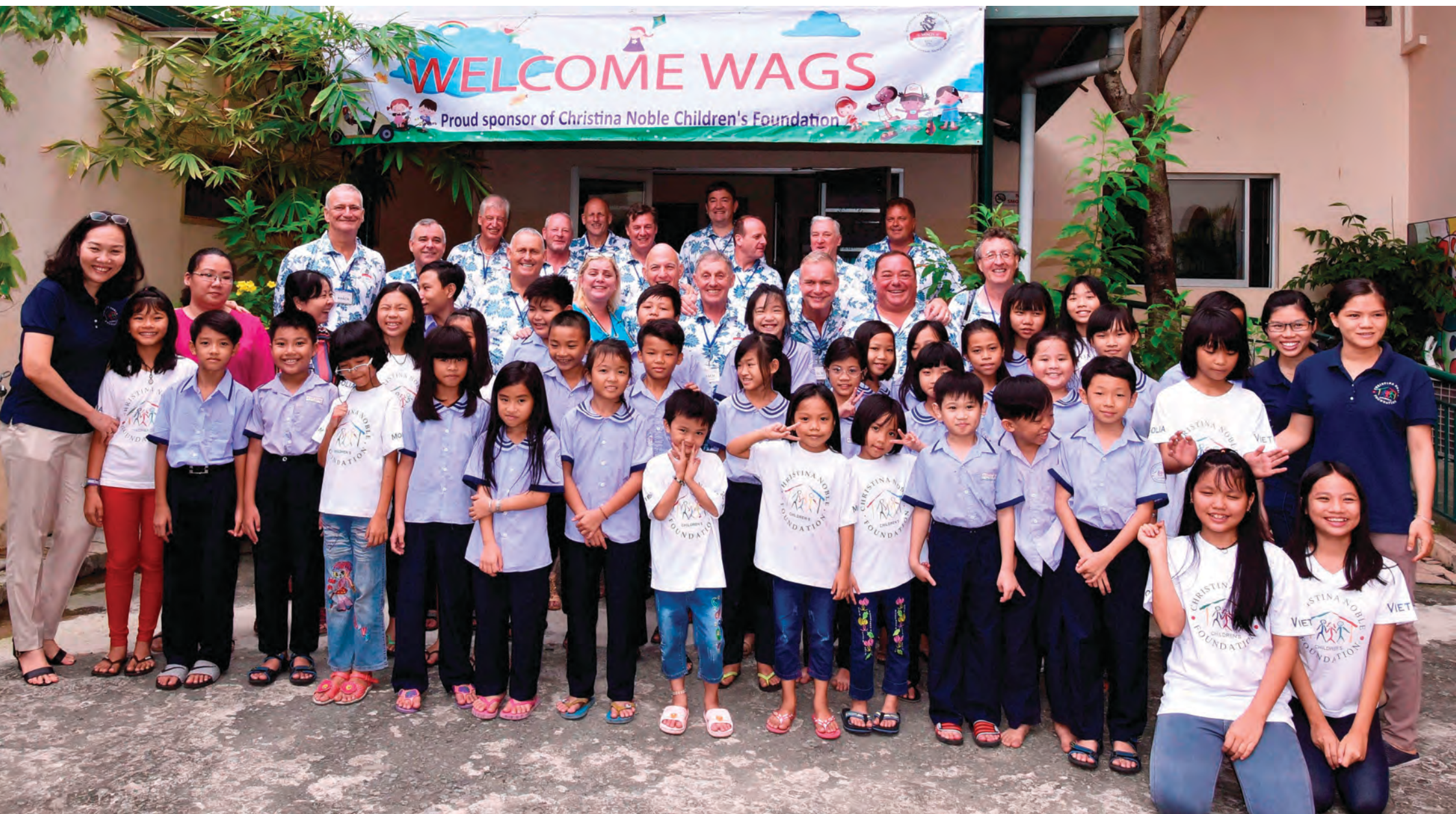
Photo: WAGS visit HCM City Vietnam