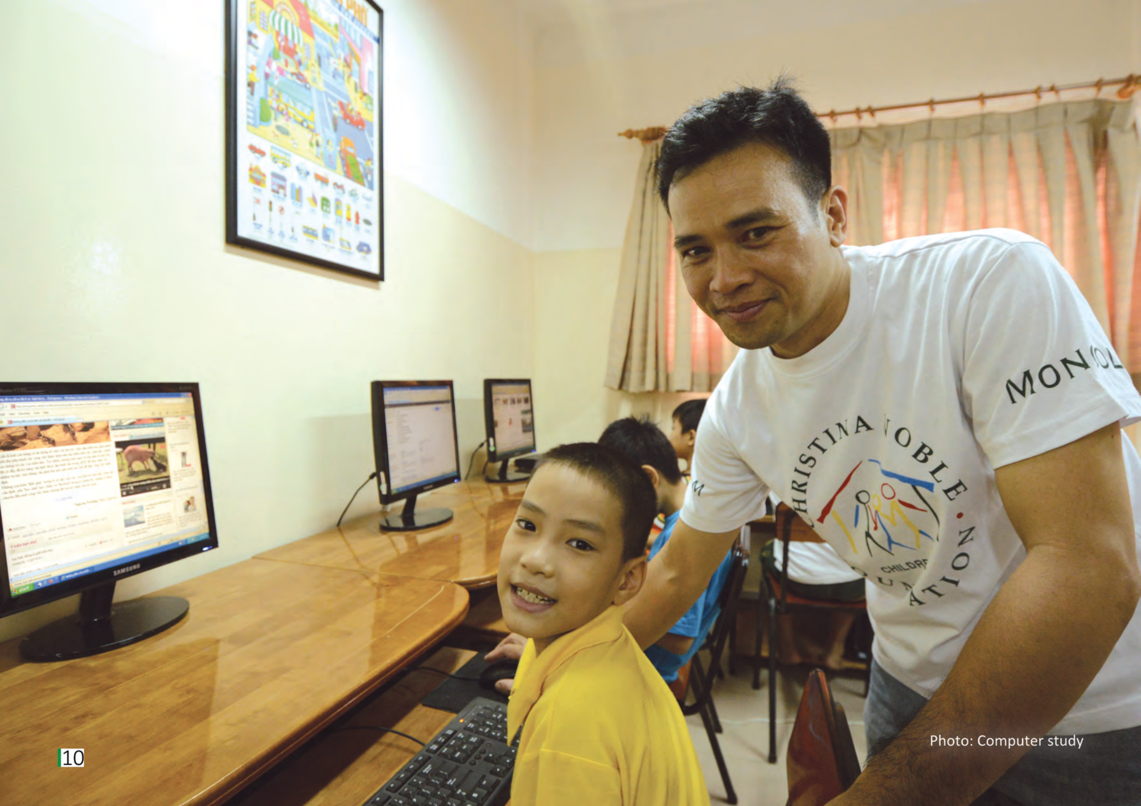
Photo: Computer study