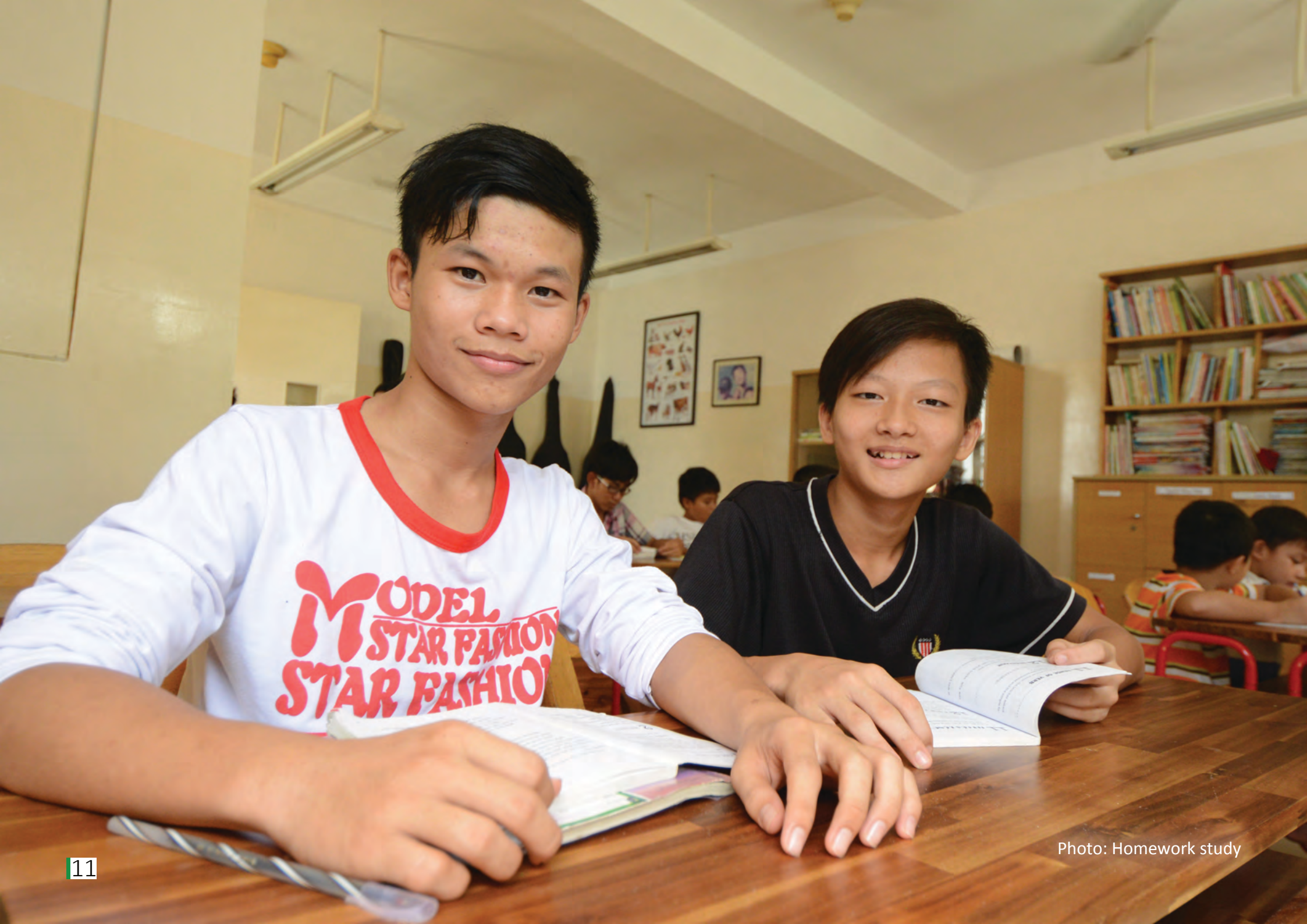
Photo: Homework study