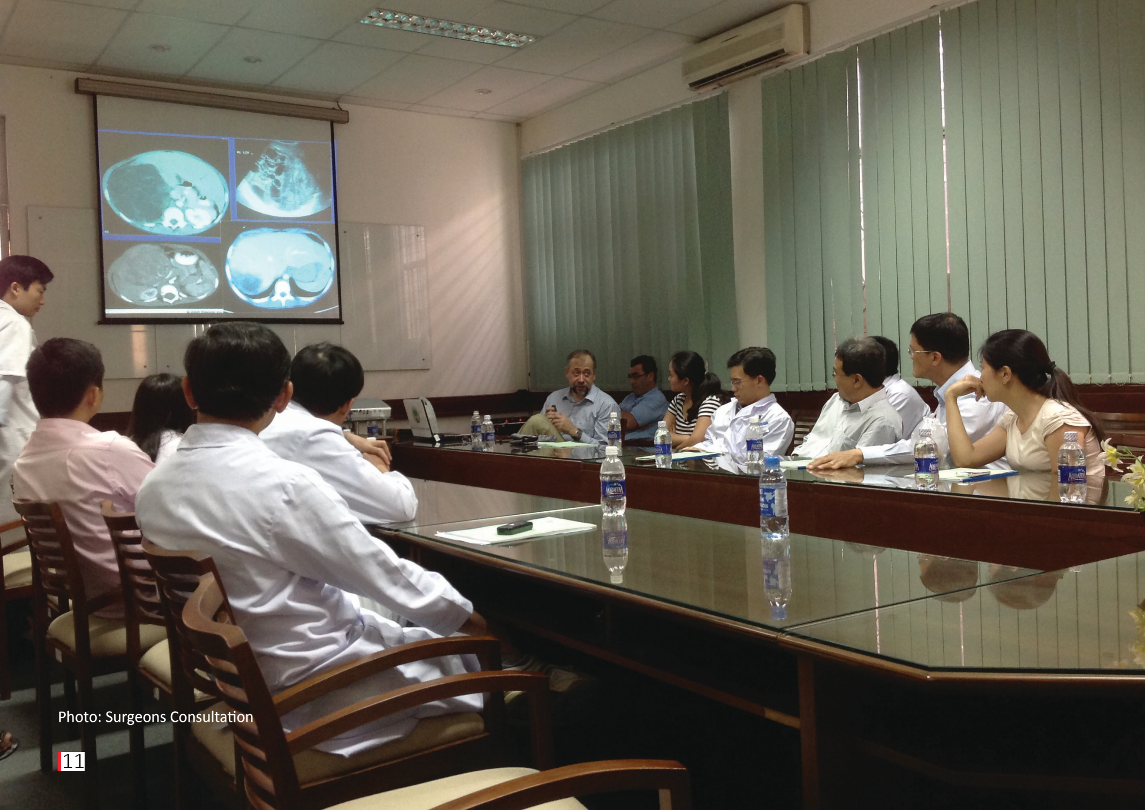
Photo: Surgeons Consultation